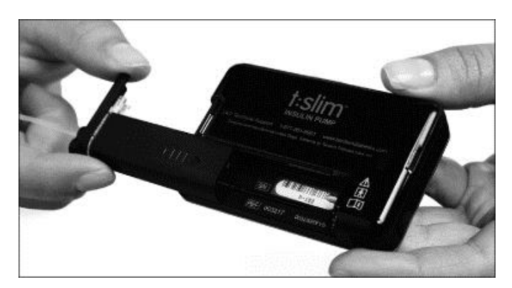
Cartridge being inserted into t:slim Insulin Pump

Our flagship product, t:slim Insulin Delivery System, is comprised of t:slim Pump, its 300-unit disposable insulin cartridge and an infusion set. We began commercial sales of t:slim in the United States in the third quarter of 2012. Measuring 2.0 \times 3.1 \times 0.6 inches, t:slim and t:slim G4 are the slimmest and smallest durable insulin pumps on the market.