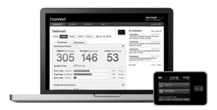
t:connect Diabetes Management Application

In 2016, we intend to launch an enhanced version of t:connect that will simplify the ability of patients to share their t:connect data with their healthcare providers, which we refer to as t:connect HCP. We expect t:connect HCP will also allow a healthcare provider to establish a separate account that centralizes t:connect data from all of their enrolled patients.