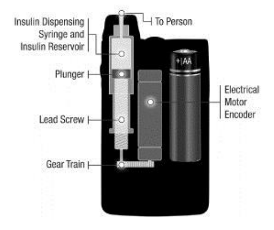
Traditional Pump Mechanism

Pump mechanism limitations. Traditional pumps utilize a syringe and plunger mechanism to deliver insulin. This design limits the ability to reduce the size of the pump due to the length and diameter of the syringe and plunger. The design also potentially exposes the user to the unintended delivery of the full volume of insulin within the pump, which can cause hypoglycemia or death. This effect is well documented and can occur when traditional pumps are elevated above the user's infusion site, referred to as siphoning, or when the user experiences pressure changes during air travel. Our research has shown that the fear of adverse health events due to technical malfunctions related to traditional pump mechanism limitations deters the adoption of insulin pump therapy.