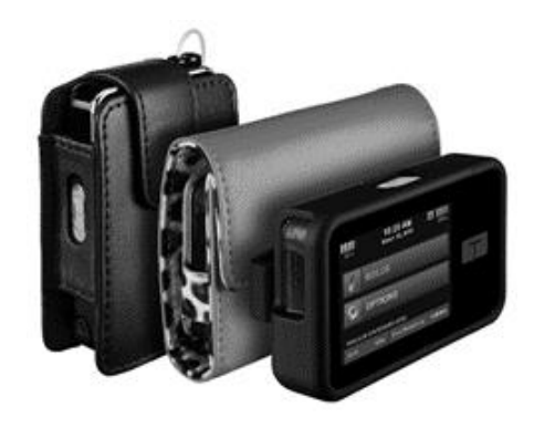
Insulin Pump Accessories