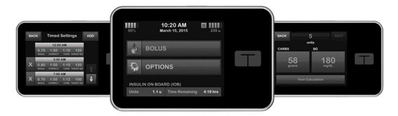
Quick Access to Pump History

Intuitive to use. Similar to what is found in modern consumer electronic devices, the embedded software displayed on our color touch screen features intuitive and commonly interpreted colors, language, icons and feedback. Our software also features numerous shortcuts, including a simple way to return to the Home Screen and view critical information for therapy management. These features were designed to enable users to operate their pump with greater confidence and expand the set of functions that they regularly utilize. Users can also execute most tasks in fewer steps than traditional pumps. We believe these features allow users to more efficiently manage their diabetes without fear or frustration.