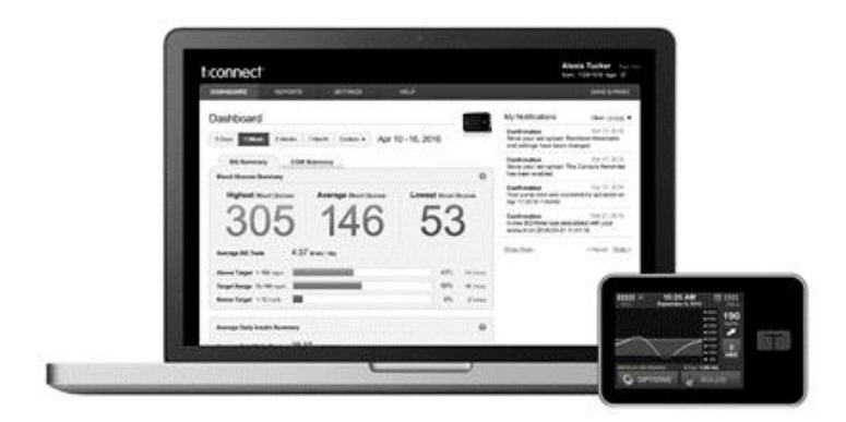
t:connect Diabetes Management Application

In 2017, we launched an enhanced version of t:connect that we expect will simplify the ability of pump users to share t:connect data with their healthcare providers, which we refer to as t:connect HCP. This application allows a healthcare provider to establish a separate account that centralizes t:connect data from all of their enrolled patients.