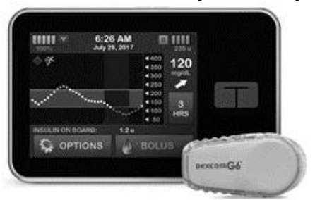
t:slim X2 with Control IQ

We previously referred to this system under its development name, the t:slim X2 with TypeZero and, following FDA approval, intend to market the product under the name t:slim X2 with Control IQ. This hybrid closed loop product will be differentiated from competing products, as we expect it will provide automated correction boluses, which we believe will bring additional benefits to our customers. In our market research, people with insulin-dependent diabetes and their healthcare providers reported a strong preference for t:slim X2 with Control IQ as compared to a competitive AID system.