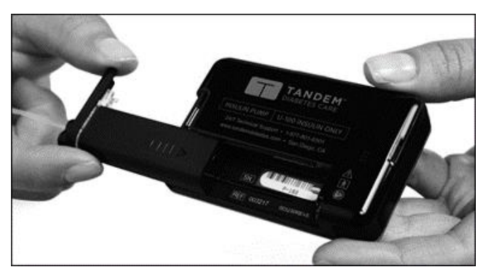
300-unit Insulin Cartridge being inserted into t:slim X2 Pump

Our next-generation flagship product, the t:slim X2 Insulin Delivery System, is comprised of a t:slim X2 pump, its 300-unit disposable insulin cartridge and an infusion set. We began commercial sales of t:slim X2 in the United States in the fourth quarter of 2016. Measuring 2.0 x 3.1 x 0.6 inches, t:slim X2 is the slimmest and smallest durable insulin pump on the market. t:slim X2 features new hardware advancements, including a two-way Bluetooth wireless technology radio for communicating with more than one external device at a time.