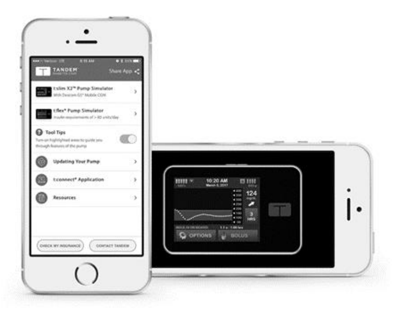
t:simulator App Accessible Through Mobile Device

Easy to learn and teach. Our technology platform allows for the use of a color touchscreen and easy-to-navigate software architecture, providing users intuitive access to the key functions of their pumps directly from the Home Screen. Insulin pump users can quickly learn how to efficiently navigate their pumps' software, thereby enabling healthcare providers to spend less time teaching a person how to use the pump and more time improving management of their diabetes. We believe these features also allow healthcare providers to more efficiently train people to use our pump and have a higher degree of confidence that users can successfully operate our pump, including its more advanced features. Our touchscreen technology also allows us to offer our t:simulator App, which permits anyone to experience our easy-to-navigate software for any of our pumps free of charge on a mobile device. We believe the ease with which our pump can be learned and taught, and the accessibility of our t:simulator App that broadly demonstrates our software technology, will help attract consumers who may have been frustrated or intimidated by traditional pumps.