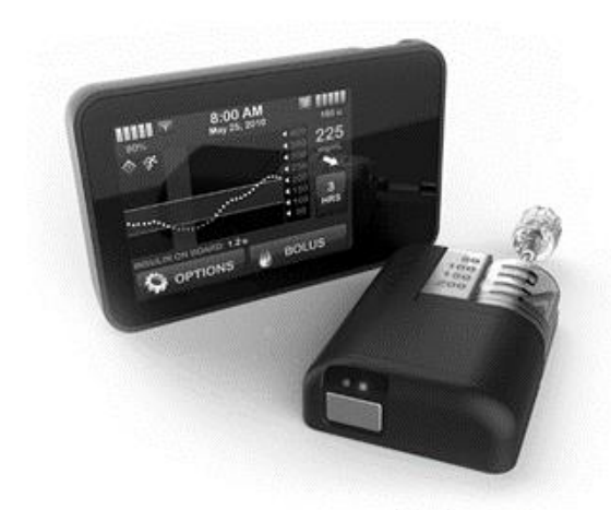
t:sport shown with touchscreen controller

Our next generation hardware platform is referred to under its development name, the t:sport Insulin Delivery System, or t:sport. This product is expected to be half the size of t:slim and is being designed for people who seek even greater discretion and flexibility with the use of their insulin pump. We anticipate that t:sport will feature a low-cost 200-unit cartridge, an on-pump bolus button, a rechargeable battery, an AID algorithm, and a Bluetooth radio. t:sport is being designed for use with leading U-100 insulins, and in 2018 we plan to conduct research on the use of insulin concentrates to provide people with greater insulin needs an alternative to t:flex. We are also evaluating offering a 300-unit cartridge alternative. We anticipate that t:sport will utilize a pumping mechanism that differs from our current Micro-Delivery technology and will be controlled through a separate controller or mobile device application.