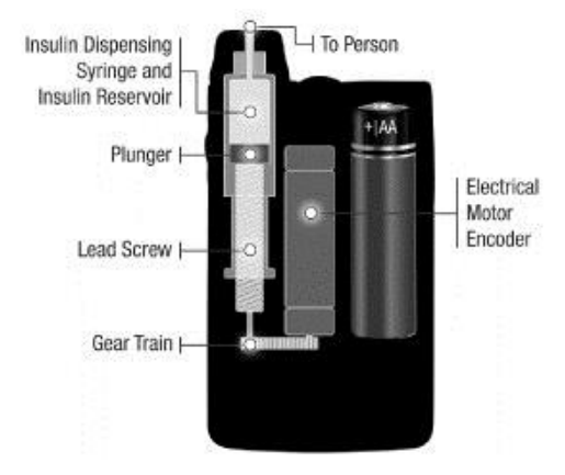
Traditional Pump Mechanism

Pump mechanism limitations. Traditional pumps utilize a mechanism in which a lead screw drives a plunger to deliver insulin. This design limits the ability to reduce the size of the pump due to the length and diameter of the syringe and lead screw.