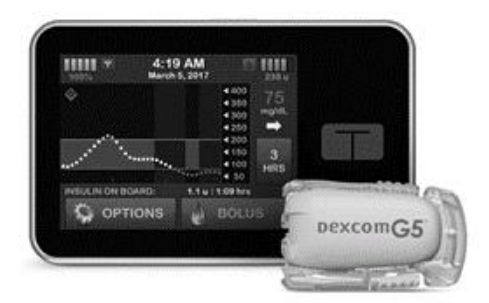
t:slim X2 with Basal IQ

The t:slim X2 with Basal IQ is designed to utilize Dexcom G5 sensor values to adjust the rate of insulin delivery to help minimize the frequency and/or duration of hypoglycemic events. The algorithm was developed internally in consultation with clinical thought leaders in AID research. In our market research, a predictive low glucose suspend, or PLGS, algorithm was reported as the most valuable AID feature among people with insulin-dependent diabetes and their healthcare providers.