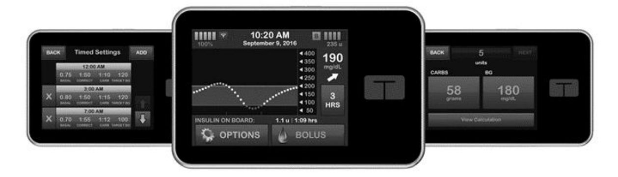
Easy-to-Navigate Pump Software Architecture

Innovative technology. Our Micro-Delivery technology is unique compared to traditional pumps. Its miniaturized pumping mechanism draws insulin from a flexible bag within the pump's cartridge rather than relying on a mechanical syringe and lead screw mechanism. Our technology was tested under both typical and extreme operating conditions and is designed to last for at least the anticipated four-year warranty of the pump. Our technology allows us to reduce the size of the device as compared to traditional pumps, making t:slim X2 the slimmest and smallest durable insulin pump on the market. In addition, our technology is capable of delivering the smallest increment of insulin compared to any pump currently available, which allows insulin therapy to be individualized for each user.