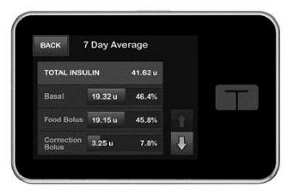
Quick Access to Pump History

Innovative technology. Our Micro-Delivery technology is unique compared to traditional pumps. Its miniaturized pumping mechanism draws insulin from a flexible bag within the pump's cartridge rather than relying on a mechanical syringe and lead screw mechanism. Our technology was tested under both typical and extreme operating conditions and is designed to last for at least the anticipated four-year warranty of the pump. Our technology allows us to reduce the size of the device as compared to traditional pumps, making t:slim X2 the slimmest and smallest durable insulin pump on the market. In addition, our technology is capable of delivering the smallest increment of insulin compared to any pump currently available, which allows insulin therapy to be individualized for each user.