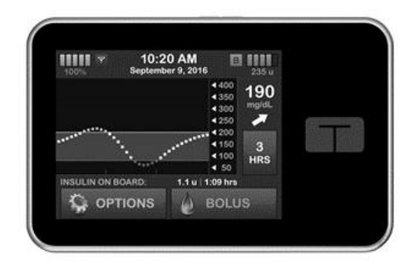
Our t:slim X2 Insulin Pump Form Factor (Actual Size)

Adaptable platform. The t:slim X2 platform is highly adaptable as a result of a number of features that are inherent within our proprietary technology, including our easy-to-navigate software architecture and touchscreen user interface. t:slim X2 is also compatible with the Tandem Device Updater, which is a tool that allows pump users to update their pumps' software quickly and easily from a personal computer. This tool uniquely positions us to bring new features and benefits, such as CGM integration or AID algorithms, to customers within their typical four-year insurance pump replacement cycle. We believe the adaptability of our pump platform uniquely positions us to address the needs and preferences of people with insulin-dependent diabetes, and to do so quickly as those needs and preferences change and the functionality of our products evolves.