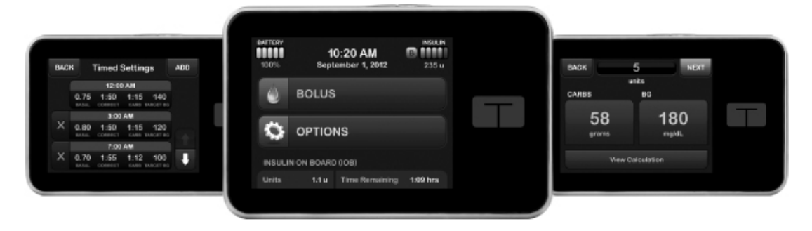
Easy-to -Navigate Pump Software Architecture

Easy to learn and teach. Our technology platform allows for the use of a vivid touchscreen and easy-to-navigate software architecture, providing users simple access to the key functions of their pump directly from the Home Screen. Insulin pump users can quickly learn how to efficiently navigate their pump's software, thereby enabling healthcare providers to spend less time teaching a person how to use the pump and more time improving management of their diabetes. We believe these features also allow healthcare providers to more efficiently train people to use our pump and have a higher degree of confidence that users can successfully operate our pump, including its more advanced features. We also believe the ease with which our pump can be learned and taught will help attract current insulin pump users as well as people who may have been frustrated or intimidated by traditional pumps.