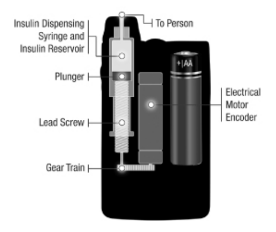
Traditional Pump Mechanism

We believe that these shortcomings of traditional pumps have limited the adoption of pump therapy. By addressing these issues, there is a meaningful opportunity to not only respond to the concerns and unmet needs of traditional insulin pump users, but also to motivate eligible MDI users to adopt pump therapy.