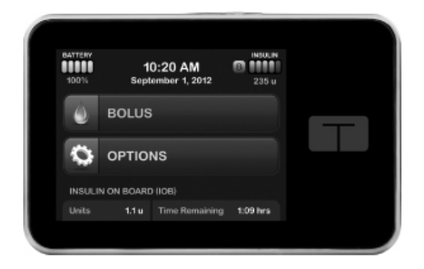
t:slim Insulin Delivery System (Actual Size)

Contemporary style. Our approved products, t:slim and t:flex, as well as all of our products under development, have the look and feel of a modern consumer electronic device, such as a smartphone. Relying on significant consumer input and feedback during the development process, we believe the aesthetically-pleasing, modern design of our products addresses the embarrassing appearance-related concerns of insulin pump users. Key product features such as a high-resolution, color touchscreen with shatter-resistant glass, aluminum casing and rechargeable battery, make our products unique in the insulin pump market. In addition, we designed a broad range of accessories allowing users to customize their pump to their individual lifestyle and sense of style.