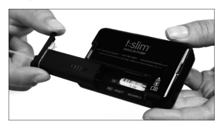
Cartridge being Inserted into t:slim pump

The t:slim Insulin Delivery System is comprised of the t:slim pump, its 300-unit disposable insulin cartridge and an infusion set. We commercially introduced t:slim in the United States in the third quarter of 2012.