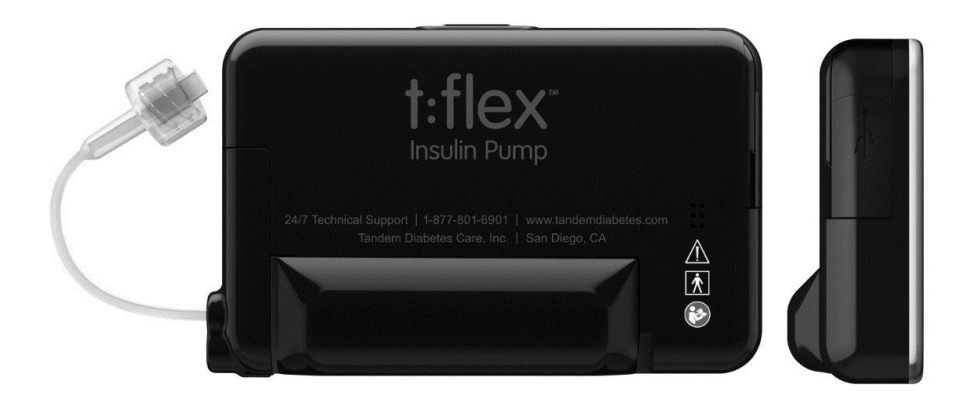
t:flex Insulin Delivery System

The t:flex Insulin Delivery System is comprised of the t:flex pump, its 480-unit disposable insulin cartridge and an infusion set. We intend to begin commercial sales of t:flex in the United States in the second quarter of 2015.