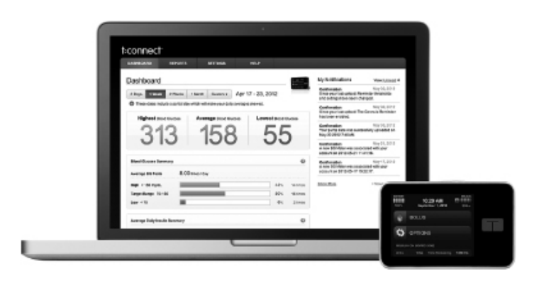
t:connect Diabetes Management Application

We developed t:connect to be intuitive, with the same consumer-focused approach utilized in the development of our insulin pumps. It features built-in smart logic that manages duplicate blood glucose readings from a user's pump and blood glucose meter to ensure report accuracy. t:connect also can generate color-coded graphs and interactive, multi-dimensional reports that make it easy to identify therapy management trends, problems and successes. There are six different report options, including a dashboard, therapy timeline, blood glucose trends, activity summary, notes and logbook and pump settings. While our insulin pumps hold the data generated over a period of up to 90 days, once a user uploads to t:connect their therapy management information is retained for as long as they retain an account. t:connect maintains the highest standards of patient data privacy and is hosted on secure, Health Insurance Portability and Accountability Act of 1996, or HIPAA, compliant servers.