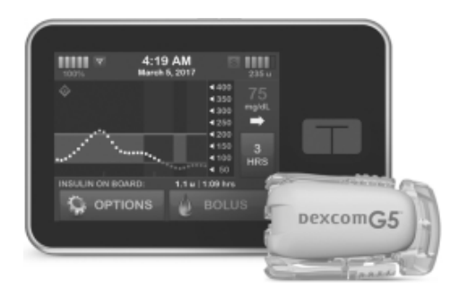
t:slim X2 with Basal IQ

The t:slim X2 with Basal IQ is designed to utilize Dexcom G5 sensor values to adjust the rate of insulin delivery to help minimize the frequency and/or duration of hypoglycemic events. The algorithm was developed internally in consultation with clinical thought leaders in AID research. In our market research, a predictive low glucose suspend, or PLGS, algorithm was reported as the most valuable AID feature among people with insulin-dependent diabetes and their healthcare providers.