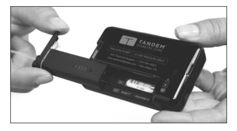
300-unit Insulin Cartridge being inserted into t:slim X2 Pump

United States in the fourth quarter of 2016. Measuring 2.0 x 3.1 x 0.6 inches, t:slim X2 is the slimmest and smallest durable insulin pump on the market. t:slim X2 features new hardware advancements, including a two-way Bluetooth wireless technology radio for communicating with more than one external device at a time.