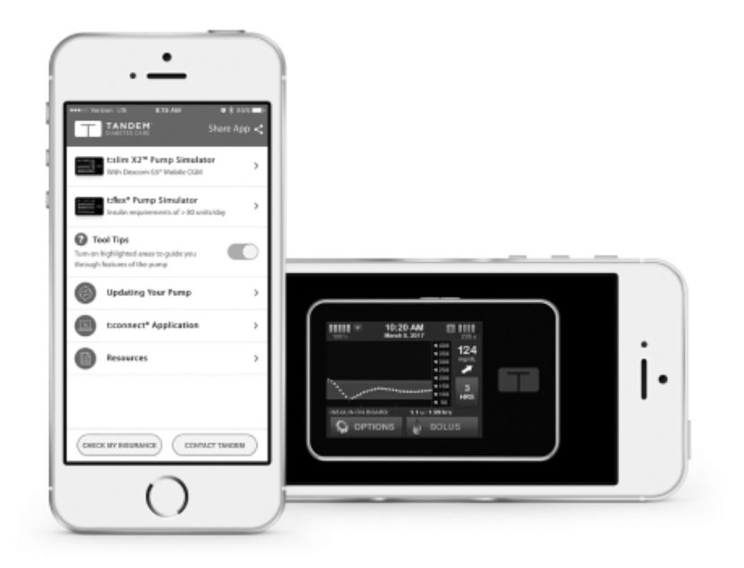
t:simulator App Accessible Through Mobile Device

Easy to learn and teach. Our technology platform allows for the use of a color touchscreen and easy-to-navigate software architecture, providing users intuitive access to the key functions of their pumps directly from the Home Screen. Insulin pump users can quickly learn how to efficiently navigate their pumps' software, thereby enabling healthcare providers to spend less time teaching a person how to use the pump and more time improving management of their diabetes. We believe these features also allow healthcare providers to more efficiently train people to use our pump and have a higher degree of confidence that users can successfully operate our pump, including its more advanced features. Our touchscreen technology also allows us to offer our t:simulator App, which permits anyone to experience our easy-to-navigate software for any of our pumps free of charge on a mobile device. We believe the ease with which our pump can be learned and taught, and the accessibility of our t:simulator App that broadly demonstrates our software technology, will help attract consumers who may have been frustrated or intimidated by traditional pumps.