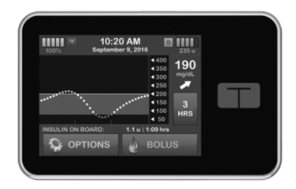
Our t:slim X2 Insulin Pump Form Factor (Actual Size)

Contemporary style. t:slim X2, as well as our products under development, has the look and feel of a modern consumer electronic device, such as a smartphone. Relying on extensive consumer input and feedback received during the development process, we believe the modern and innovative design of our products addresses the embarrassing appearance-related concerns of insulin pump users. Key product features such as a high-resolution, color touchscreen with shatter-resistant glass, aluminum casing and rechargeable battery, make t:slim X2 unique in the insulin pump market.