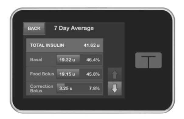
Quick Access to Pump History

Innovative technology. Our Micro-Delivery technology is unique compared to traditional pumps. Its miniaturized pumping mechanism draws insulin from a flexible bag within the pump's cartridge rather than relying on a mechanical syringe and lead screw mechanism. Our technology was tested under both typical and extreme operating conditions and is designed to last for at least the anticipated four-year warranty of the pump. Our technology allows us to reduce the size of the device as compared to traditional pumps, making t:slim X2 the slimmest and smallest durable insulin pump on the market. In addition, our technology is capable of delivering the smallest increment of insulin compared to any pump currently available, which allows insulin therapy to be individualized for each user.