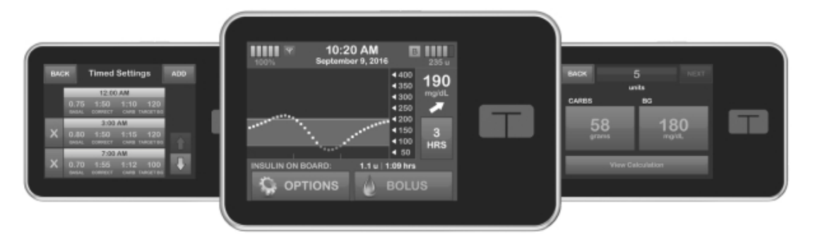
Easy-to-Navigate Pump Software Architecture

Intuitive to use. Similar to what is found in modern consumer electronic devices, the embedded software displayed on our color touchscreen features intuitive and commonly interpreted colors, language, icons and feedback. Our software also features numerous shortcuts, including a simple way to return to the Home Screen and view critical information for therapy management. These features were designed to enable users to operate their pump more efficiently and with greater confidence, and to expand the set of therapy features they regularly utilize. Users can also execute most tasks in fewer steps than traditional pumps, which we believe further encourages people to use more advanced pump features. We believe these features also allow users to more efficiently manage their diabetes without fear or frustration.