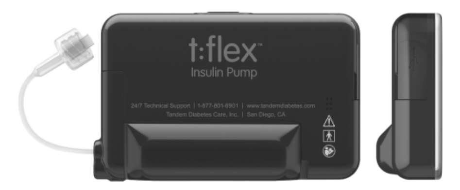
t:flex Insulin Pump

The t:flex Insulin Delivery System is comprised of a t:flex pump, its 480-unit disposable insulin cartridge and an infusion set. We began commercial sales of t:flex in the United States in the second quarter of 2015.