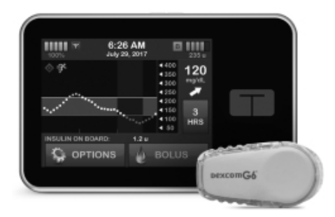
t:slim X2 with Control IQ

We previously referred to this system under its development name, the t:slim X2 with TypeZero and, following FDA approval, intend to market the product under the name t:slim X2 with Control IQ. This hybrid closed loop product will be differentiated from competing products, as we expect it will provide automated correction boluses, which we believe will bring additional benefits to our customers. In our market research, people with insulin-dependent diabetes and their healthcare providers reported a strong preference for t:slim X2 with Control IQ as compared to a competitive AID system.