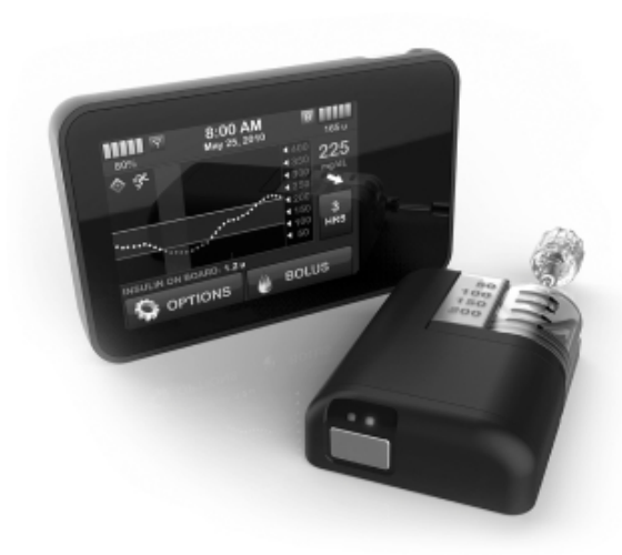
t:sport shown with touchscreen controller

that differs from our current Micro-Delivery technology and will be controlled through a separate controller or mobile device application.