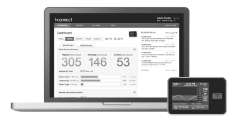
t:connect Diabetes Management Application

In 2017, we launched an enhanced version of t:connect that we expect will simplify the ability of pump users to share t:connect data with their healthcare providers, which we refer to as t:connect HCP. This application allows a healthcare provider to establish a separate account that centralizes t:connect data from all of their enrolled patients.