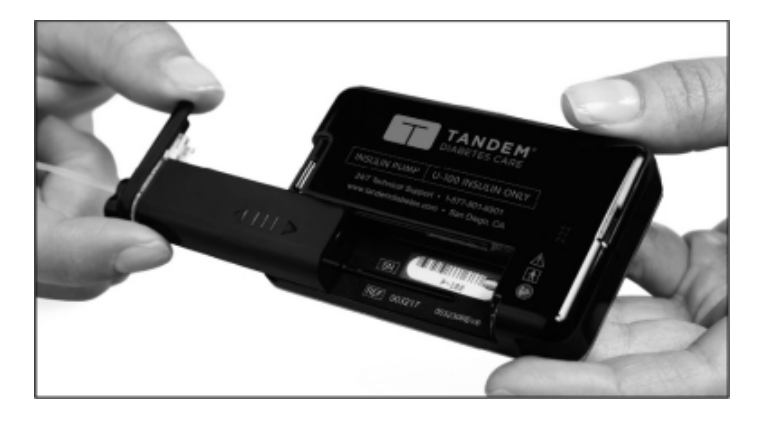
300-unit Insulin Cartridge being inserted into t:slim X2 Pump

United States in the fourth quarter of 2016. Measuring 2.0 x 3.1 x 0.6 inches, t:slim X2 is the slimmest and smallest durable insulin pump on the market. t:slim X2 features new hardware advancements, including a two-way Bluetooth wireless technology radio for communicating with more than one external device at a time.