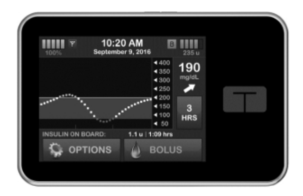
Our t:slim X2 Insulin Pump Form Factor (Actual Size)

Contemporary style. t:slim X2, as well as our products under development, has the look and feel of a modern consumer electronic device, such as a smartphone. Relying on extensive consumer input and feedback received during the development process, we believe the modern and innovative design of our products addresses the embarrassing appearance-related concerns of insulin pump users. Key product features such as a high-resolution, color touchscreen with shatter-resistant glass, aluminum casing and rechargeable battery, make t:slim X2 unique in the insulin pump market.