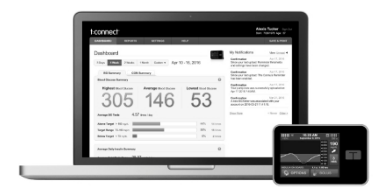
t:connect Diabetes Management Application

In 2017, we launched an enhanced version of t:connect that we expect will simplify the ability of pump users to share t:connect data with their healthcare providers, which we refer to as t:connect HCP. This application allows a healthcare provider to establish a separate account that centralizes t:connect data from all of their enrolled patients.