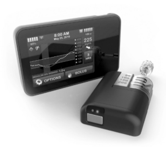
t:sport shown with touchscreen controller

that differs from our current Micro-Delivery technology and will be controlled through a separate controller or mobile device application.