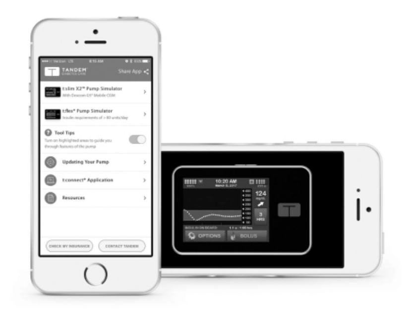
t:simulator App Accessible Through Mobile Device

Easy to learn and teach. Our technology platform allows for the use of a color touchscreen and easy-to-navigate software architecture, providing users intuitive access to the key functions of their pumps directly from the Home Screen. Insulin pump users can quickly learn how to efficiently navigate their pumps' software, thereby enabling healthcare providers to spend less time teaching a person how to use the pump and more time improving management of their diabetes. We believe these features also allow healthcare providers to more efficiently train people to use our pump and have a higher degree of confidence that users can successfully operate our pump, including its more advanced features. Our touchscreen technology also allows us to offer our t:simulator App, which permits anyone to experience our easy-to-navigate software for any of our pumps free of charge on a mobile device. We believe the ease with which our pump can be learned and taught, and the accessibility of our t:simulator App that broadly demonstrates our software technology, will help attract consumers who may have been frustrated or intimidated by traditional pumps.