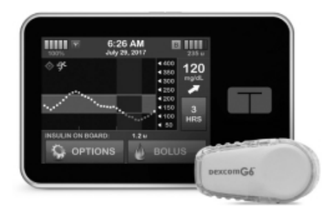
t:slim X2 with Control IQ

We previously referred to this system under its development name, the t:slim X2 with TypeZero and, following FDA approval, intend to market the product under the name t:slim X2 with Control IQ. This hybrid closed loop product will be differentiated from competing products, as we expect it will provide automated correction boluses, which we believe will bring additional benefits to our customers. In our market research, people with insulin-dependent diabetes and their healthcare providers reported a strong preference for t:slim X2 with Control IQ as compared to a competitive AID system.