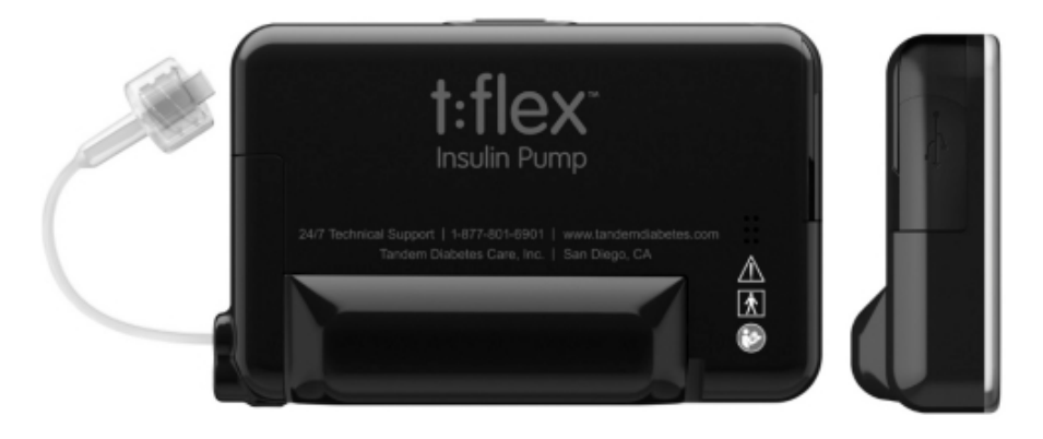
t:flex Insulin Pump

The t:flex Insulin Delivery System is comprised of a t:flex pump, its 480-unit disposable insulin cartridge and an infusion set. We began commercial sales of t:flex in the United States in the second quarter of 2015.