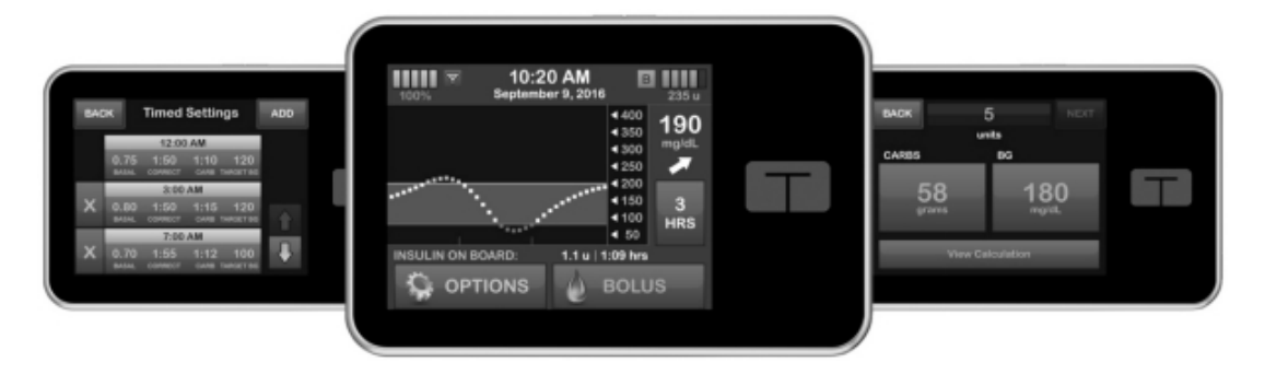
Easy-to-Navigate Pump Software Architecture

Intuitive to use. Similar to what is found in modern consumer electronic devices, the embedded software displayed on our color touchscreen features intuitive and commonly interpreted colors, language, icons and feedback. Our software also features numerous shortcuts, including a simple way to return to the Home Screen and view critical information for therapy management. These features were designed to enable users to operate their pump more efficiently and with greater confidence, and to expand the set of therapy features they regularly utilize. Users can also execute most tasks in fewer steps than traditional pumps, which we believe further encourages people to use more advanced pump features. We believe these features also allow users to more efficiently manage their diabetes without fear or frustration.