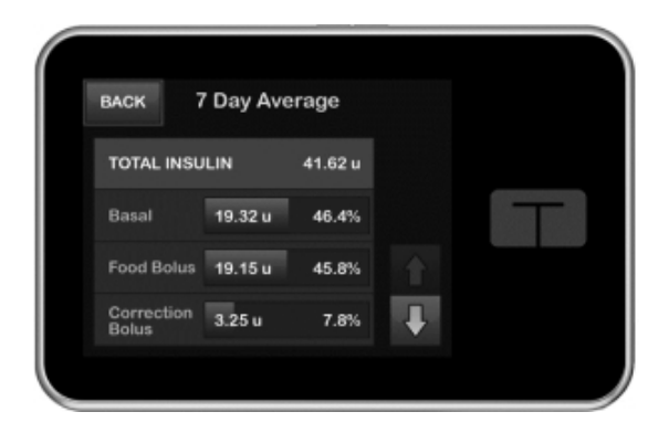
Quick Access to Pump History

Innovative technology. Our Micro-Delivery technology is unique compared to traditional pumps. Its miniaturized pumping mechanism draws insulin from a flexible bag within the pump's cartridge rather than relying on a mechanical syringe and lead screw mechanism. Our technology was tested under both typical and extreme operating conditions and is designed to last for at least the anticipated four-year warranty of the pump. Our technology allows us to reduce the size of the device as compared to traditional pumps, making t:slim X2 the slimmest and smallest durable insulin pump on the market. In addition, our technology is capable of delivering the smallest increment of insulin compared to any pump currently available, which allows insulin therapy to be individualized for each user.