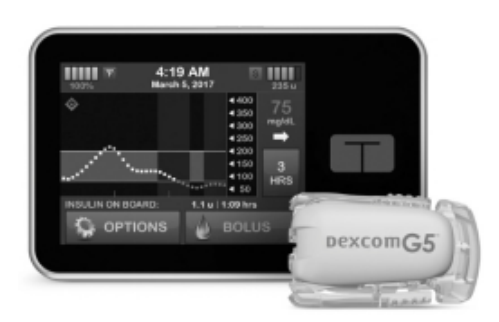
t:slim X2 with Basal IQ

The t:slim X2 with Basal IQ is designed to utilize Dexcom G5 sensor values to adjust the rate of insulin delivery to help minimize the frequency and/or duration of hypoglycemic events. The algorithm was developed internally in consultation with clinical thought leaders in AID research. In our market research, a predictive low glucose suspend, or PLGS, algorithm was reported as the most valuable AID feature among people with insulin-dependent diabetes and their healthcare providers.