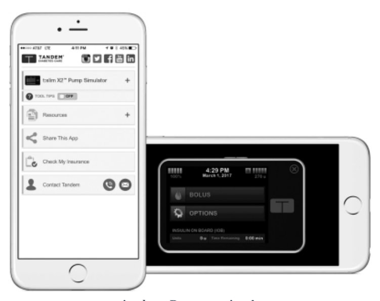
t:simulator Demonstration App

Intuitive to use. Similar to what is found in modern consumer electronic devices, the embedded software displayed on our color touchscreen features intuitive and commonly interpreted colors, language, icons and feedback. Our software also features numerous shortcuts, including a simple way to return to the Home Screen and view critical information for therapy management. These features were designed to enable users to operate their pump more efficiently and with greater confidence, and to expand the set of therapy features they regularly utilize. Users can also execute most tasks in fewer steps than traditional pumps, which we believe further encourages people to use more advanced pump features. We believe these features also allow users to more efficiently manage their diabetes without fear or frustration.