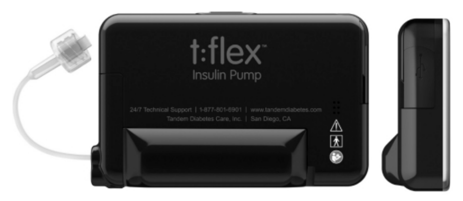
t:flex Insulin Pump

t:flex Insulin Delivery System is comprised of a t:flex Pump, its 480-unit disposable insulin cartridge and an infusion set. We began commercial sales of t:flex in the United States in the second quarter of 2015.