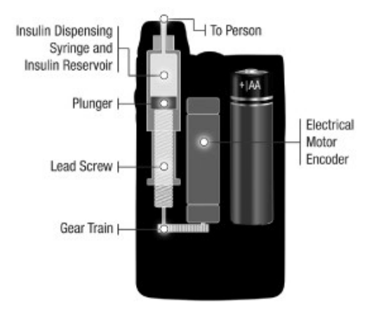
Traditional Pump Mechanism

Pump mechanism limitations. Traditional pumps utilize a syringe and plunger mechanism to deliver insulin. This design limits the ability to reduce the size of the pump due to the length and diameter of the syringe and plunger. The design also potentially exposes the user to the unintended delivery of the full volume of insulin within the pump, which can cause hypoglycemia or death. This effect is well documented and can occur when traditional pumps are elevated above the user's infusion site, referred to as siphoning, or when the user experiences changes in air pressure, such as during air travel. Our research has shown that the fear of adverse health events due to technical malfunctions related to traditional pump mechanism limitations deters the adoption of insulin pump therapy.