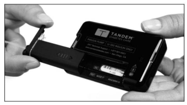
300-unit Insulin Cartridge being inserted into Pump

In the third quarter of 2016, we launched a Technology Upgrade Program that provides eligible t:slim and t:slim G4 customers a path towards ownership of t:slim X2 by providing customers the right to exchange t:slim or t:slim G4, under a variable pricing structure. The Technology Upgrade Program expires on September 30, 2017.