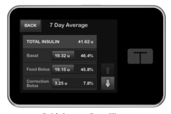
Quick Access to Pump History

Next generation technology platform. Our Micro-Delivery technology is unique compared to traditional pumps. Its miniaturized pumping mechanism draws insulin from a flexible bag within the pump's cartridge rather than relying on a mechanical syringe and plunger mechanism. The pump is specifically designed to help prevent the unintentional delivery of insulin from the reservoir by limiting the volume of insulin that can be delivered to a person at any one time and to reduce fear associated with using a pump. Our technology was tested under both typical and extreme operating conditions and is designed to last for at least the anticipated four-year warranty life of the pump. Our technology allows us to reduce the size of the device as compared to traditional pumps, which allows our pumps to be the slimmest and smallest durable insulin pumps on the market. In addition, our technology is capable of delivering the smallest increment of insulin to users of any pump currently available, which allows insulin therapy to be individualized for each user.