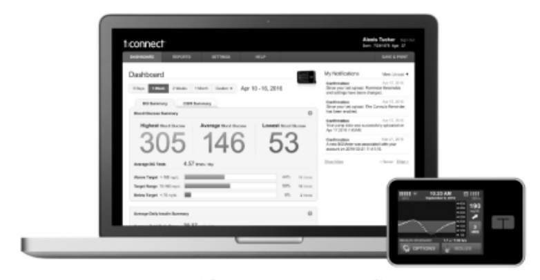
t:connect Diabetes Management Application

In 2016, we initiated the launch of an enhanced version of t:connect that we expect will simplify the ability of patients to share their t:connect data with their healthcare providers, which we refer to as t:connect HCP. We expect to make t:connect HCP available to all interested healthcare providers in 2017. This application will allow a healthcare provider to establish a separate account that centralizes t:connect data from all of their enrolled patients.