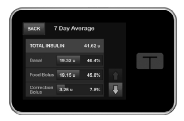
Quick Access to Pump History

Next generation technology platform. Our Micro-Delivery technology is unique compared to traditional pumps. Its miniaturized pumping mechanism draws insulin from a flexible bag within the pump's cartridge rather than relying on a mechanical syringe and plunger mechanism. The pump is specifically designed to help prevent the unintentional delivery of insulin from the reservoir by limiting the volume of insulin that can be delivered to a person at any one time and to reduce fear associated with using a pump. Our technology was tested under both typical and extreme operating conditions and is designed to last for at least the anticipated four-year warranty life of the pump. Our technology allows us to reduce the size of the device as compared to traditional pumps, which allows our pumps to be the slimmest and smallest durable insulin pumps on the market. In addition, our technology is capable of delivering the smallest increment of insulin to users of any pump currently available, which allows insulin therapy to be individualized for each user.