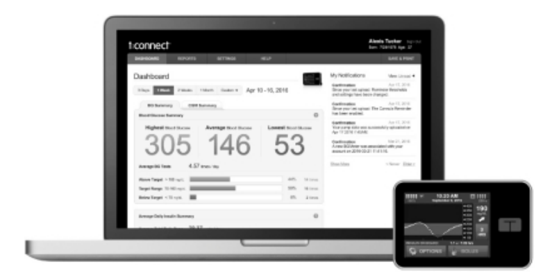
t:connect Diabetes Management Application

In 2016, we initiated the launch of an enhanced version of t:connect that we expect will simplify the ability of patients to share their t:connect data with their healthcare providers, which we refer to as t:connect HCP. We expect to make t:connect HCP available to all interested healthcare providers in 2017. This application will allow a healthcare provider to establish a separate account that centralizes t:connect data from all of their enrolled patients.