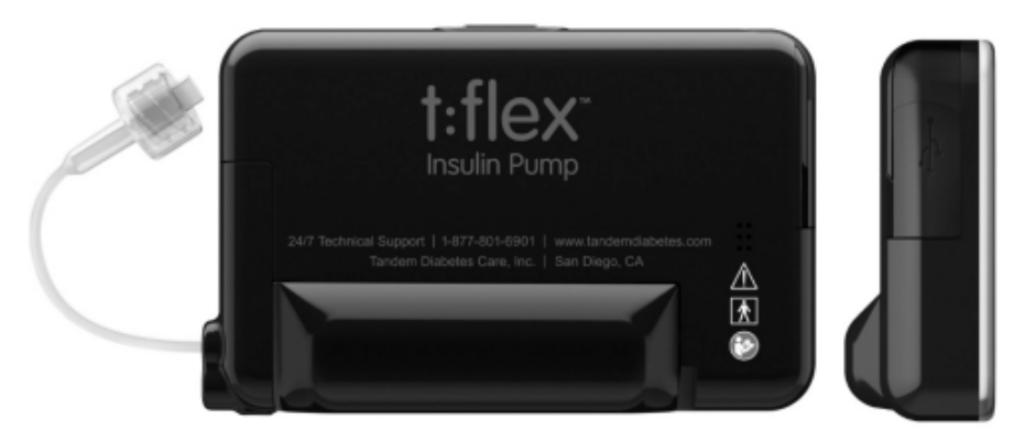
t:flex Insulin Pump

t:flex Insulin Delivery System is comprised of a t:flex Pump, its 480-unit disposable insulin cartridge and an infusion set. We began commercial sales of t:flex in the United States in the second quarter of 2015.