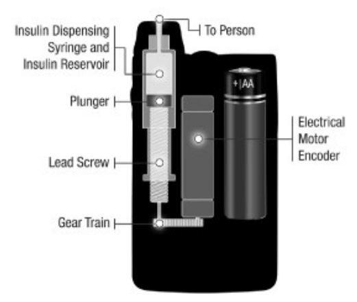
Traditional Pump Mechanism

Pump mechanism limitations. Traditional pumps utilize a syringe and plunger mechanism to deliver insulin. This design limits the ability to reduce the size of the pump due to the length and diameter of the syringe and plunger. The design also potentially exposes the user to the unintended delivery of the full volume of insulin within the pump, which can cause hypoglycemia or death. This effect is well documented and can occur when traditional pumps are elevated above the user's infusion site, referred to as siphoning, or when the user experiences changes in air pressure, such as during air travel. Our research has shown that the fear of adverse health events due to technical malfunctions related to traditional pump mechanism limitations deters the adoption of insulin pump therapy.