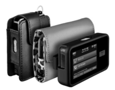
Insulin Pump Accessories

We offer our customers a broad range of accessories for their pumps, allowing users to customize their device to their individual lifestyle and sense of style. We believe our accessories increase user flexibility and willingness to use and carry their insulin pump. These accessories include different color casings, belt clips, and leather cases.